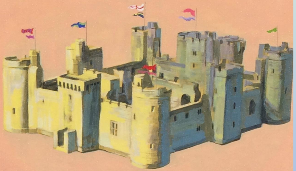
Bodiam Castle built to defend England against invasion during the Hundred Years' War 1385