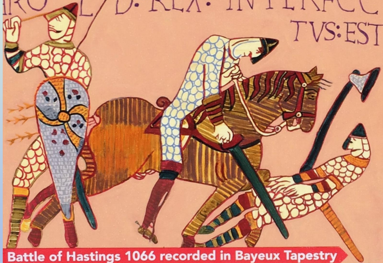
Battle of Hastings 1066 recorded in Bayeux Tapestry