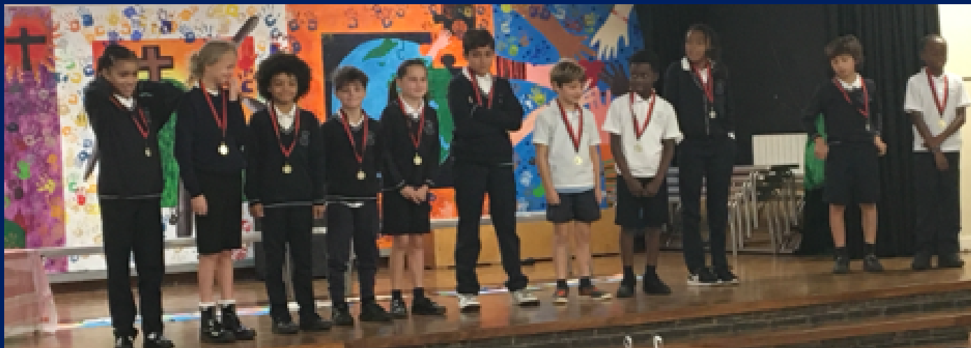
Year 5 Mixed Football Team

The Year 5 Mixed Football Team won an unbelievable 5 out of 8 matches, which included a phenomenal 5-1 win against St Gildas.