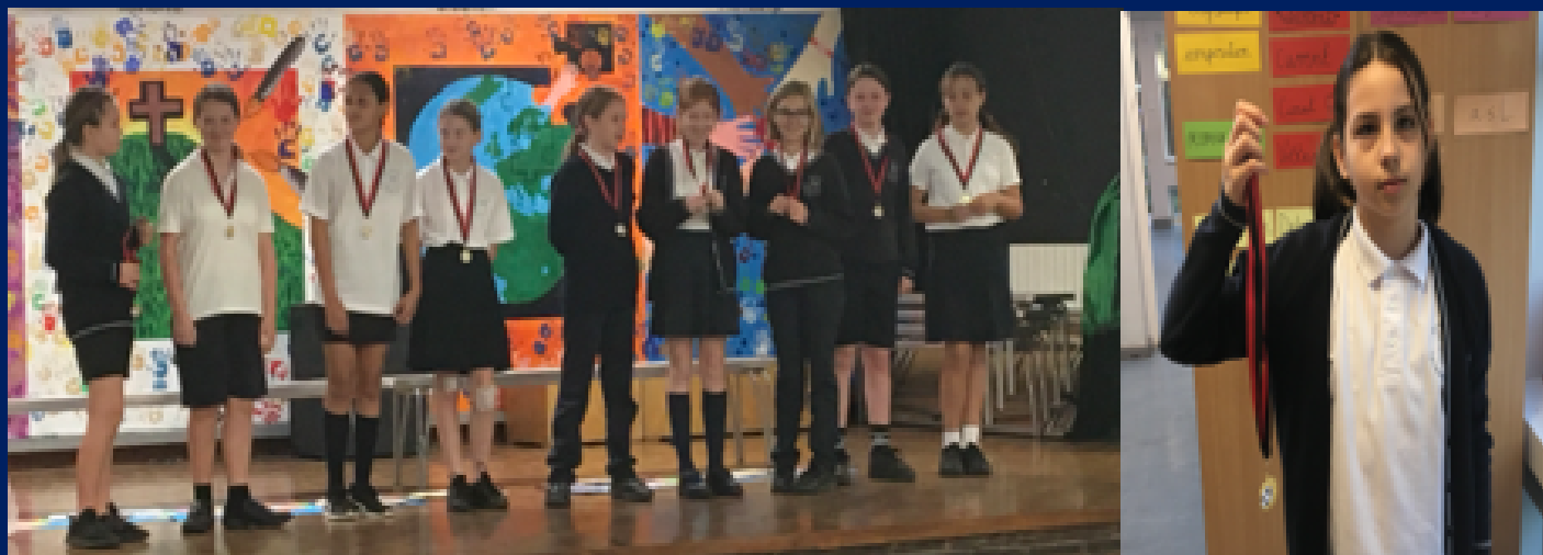
Year 6 Girls' Football Team

The Year 6 Girls' Football Team managed to get to the quarter finals of the Haringey Girls' Football Tournament.