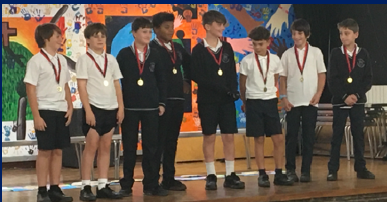
Year 6 Boys' Football Team

The Year 6 Boys' Football Team managed several amazing wins, including a 5-1 victory!