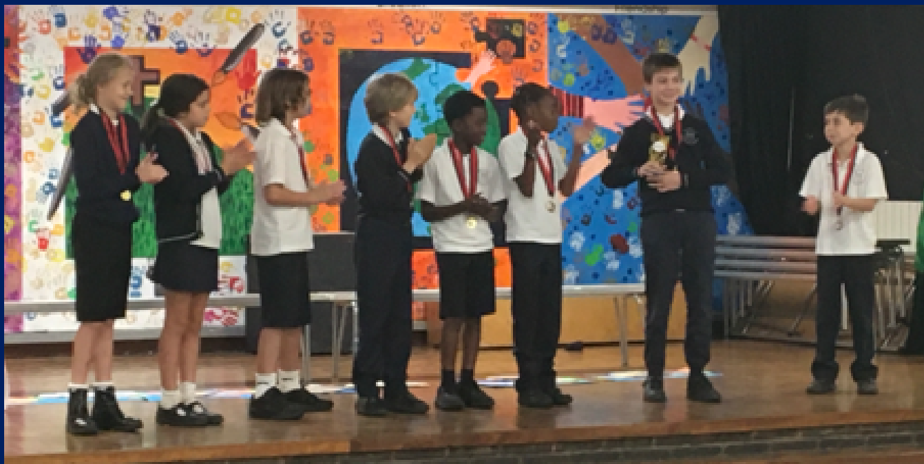
Year 5/6 Cross Country Team